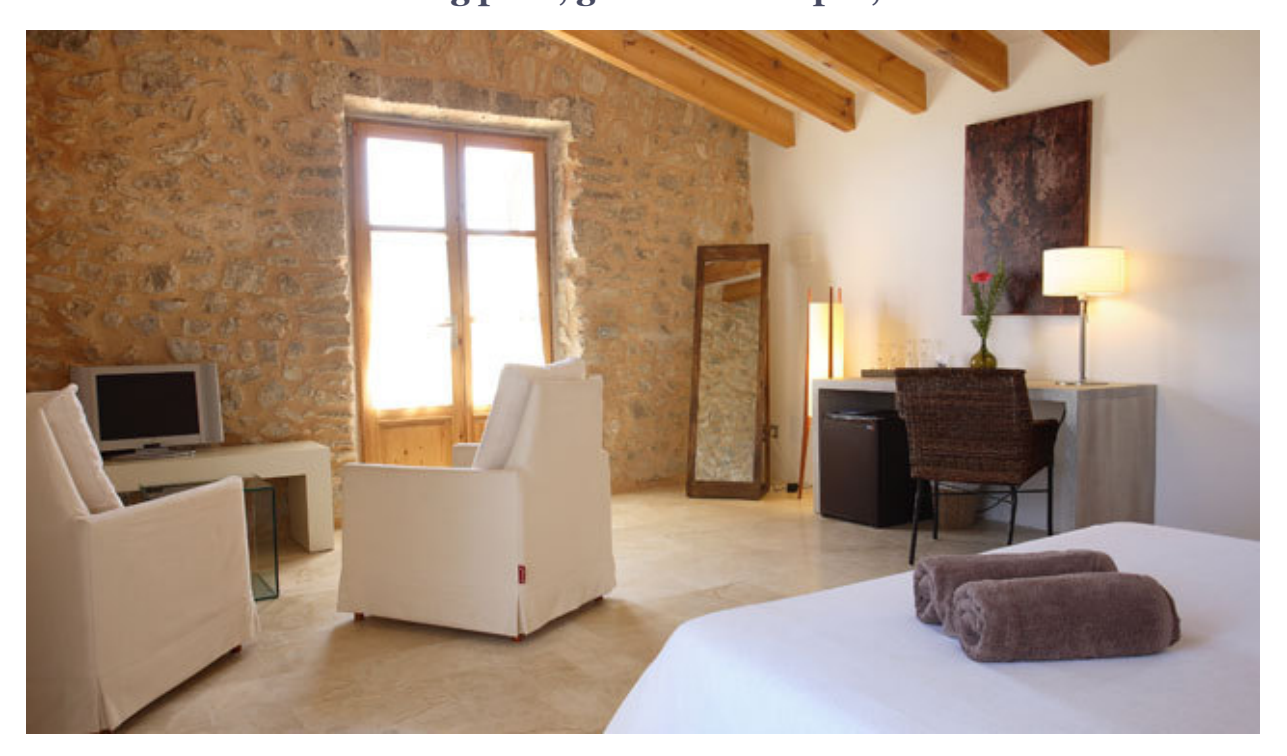
Price per night, Breakfast and VAT incl.

Sleep in magnificent rooms and rest in full contact with nature. To do so, you can choose from among our four suites, three double rooms and one single room. The distinguishing features of all of our rooms are their ample space, their light and above all, their decoration. The absolute uniformity of our flooring, ceilings and walls is complete with avant-garde furniture and decorative items featuring pure, geometric shapes, all in metal and wood.